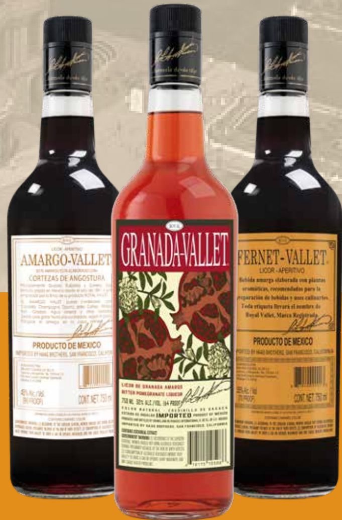
Palacio de Bellas Artes, México D.F. Circa 1904