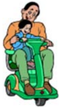
ELECTRIC WHEELCHAIR AVAILABLE