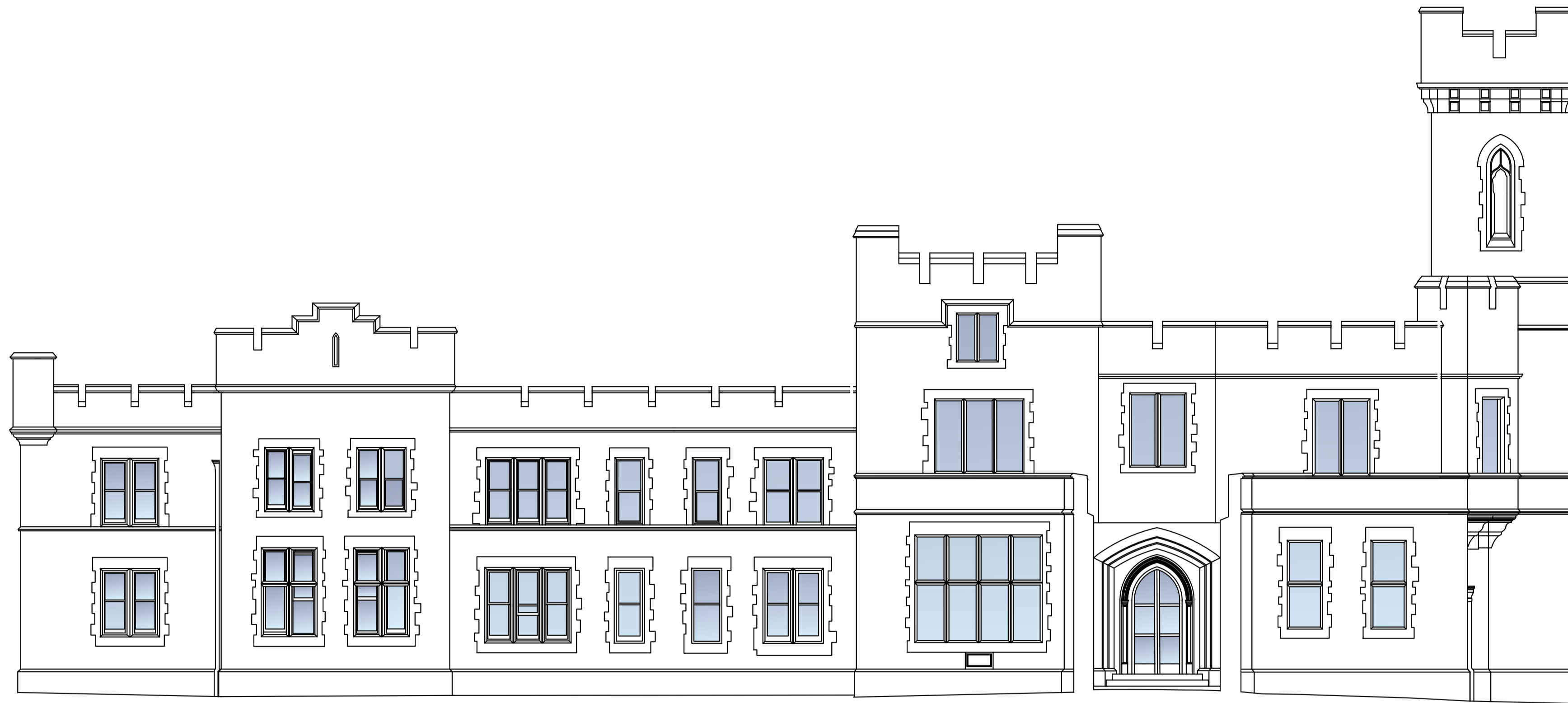
P ELEVATION 3 \nabla 55.00m SCALE 1:100