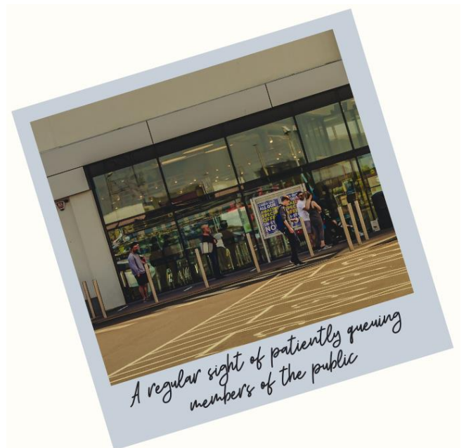
A regular sight of patiently queuing members of the public

Each day as I arrive at work, I walk past a long queue of customers patiently waiting to gain entry to the store supervised by the door marshal. The customers remain in good spirits even though they can be waiting for as long as thirty minutes. The main difference from before lockdown is that customer numbers are restricted so there is much more space, which customers seem to prefer to the way they shopped before. On the tills, screens have been erected, gloves and hand sanitizer are provided, there are antibacterial wipes to clean the till area and card machines and all baskets are cleaned after each customer's use. I always wear my gloves, although by the end of my shift my hands are wet and my fingertips are all shrivelled