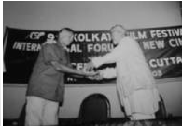
Jiri Menzel receiving the Satyajit Ray Lifetime Achievement Award at International Forum of New Cinema at Metro Cinema in 2003.

Max von Sydow died on March 8, 2020, in Provence, France. He was 90.