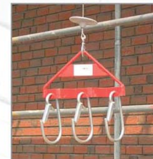
Hoisting chain for scaffold elements