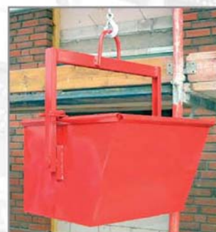
Mortar container 45kg