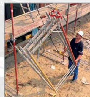
Lifting of scaffold elements