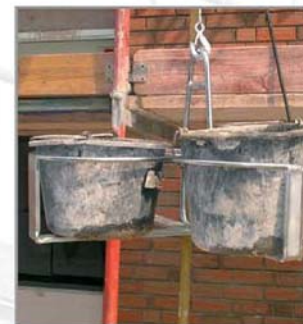
Hoisting ring for four buckets

There are various accessories to lift all kinds of load. Even lifting of bulky material is no problem. All products fit perfectly and correspond to the actual safety standards.