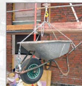
Hoisting chain for wheelbarrows