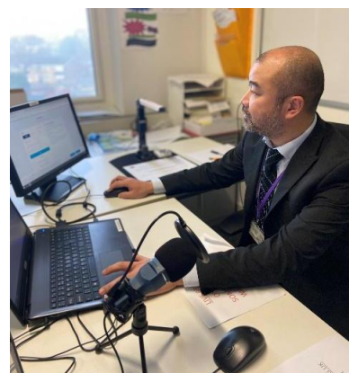
Delivering live lessons from one of our studios in the academy.