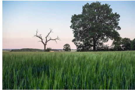
Photo of Barley Fields next to Stagsden Wood

Please be patient with us. We are keeping the situation under constant review and will update you further as soon as any decisions are made