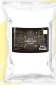
Eggless Vanilla Cake Premix