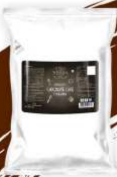
Eggless Chocolate Cake Premix