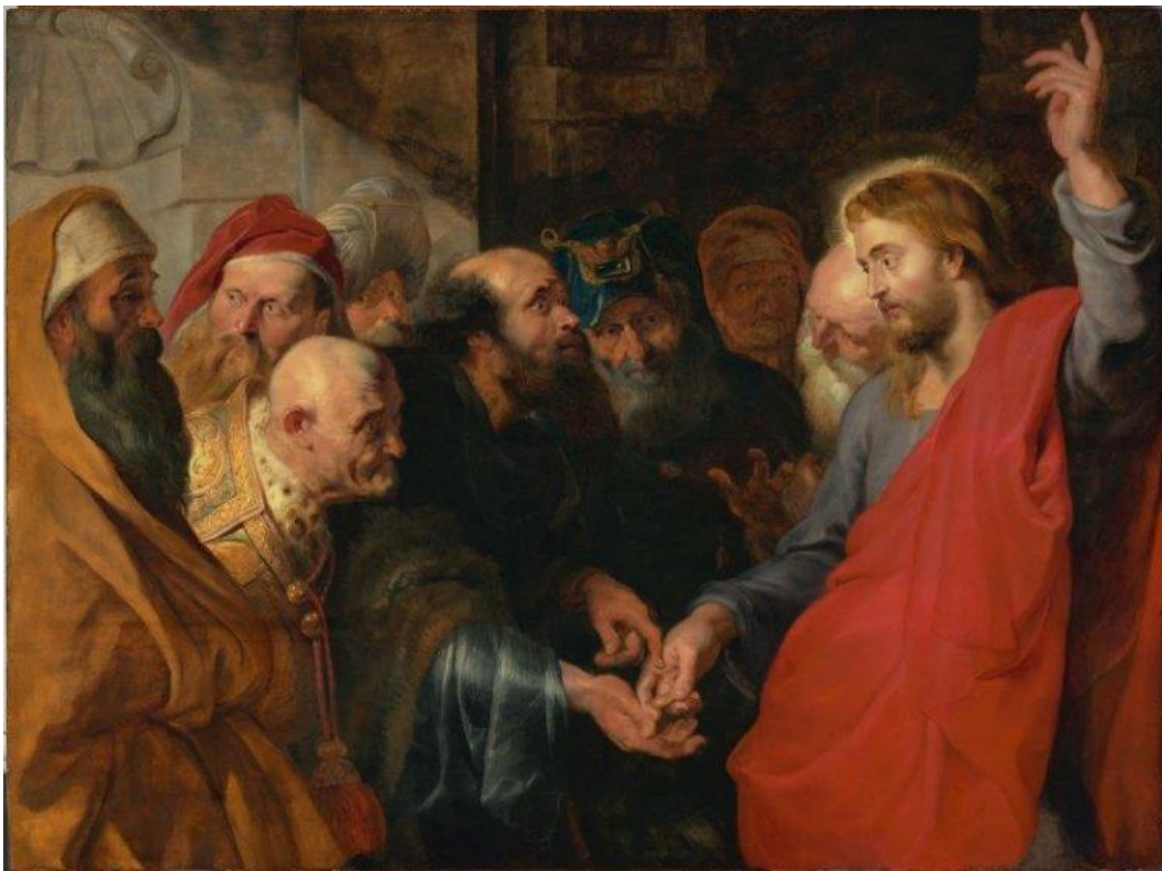
The Tribute Money by Peter Paul Rubens 1614

Here we see Paul's concern for the Christians at Thessalonika. (1 Thessalonians 1:1-5)