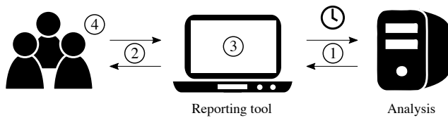
Figure 1: Workflow of a traditional use of static analysis. 1–4 show where gamification can be applied.

not know if their fix worked, if it didn't, or if it introduced a new bug. This impedes relatedness and competence . Static analysis is a case where too much autonomy is given to the developer: to build its own model, an analysis makes assumptions that may differ from the developer's understanding of the code. This makes it harder for developers to understand why the analysis reports a warning and if it is relevant to them, leaving them on their own as to how to fix it [6, 17]. This traditional way of using static analysis can thus be detrimental to the developer's experience.