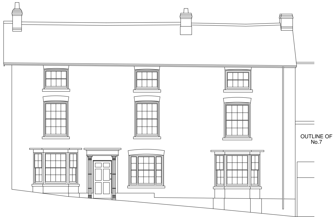
Proposed Front / South West Elevation