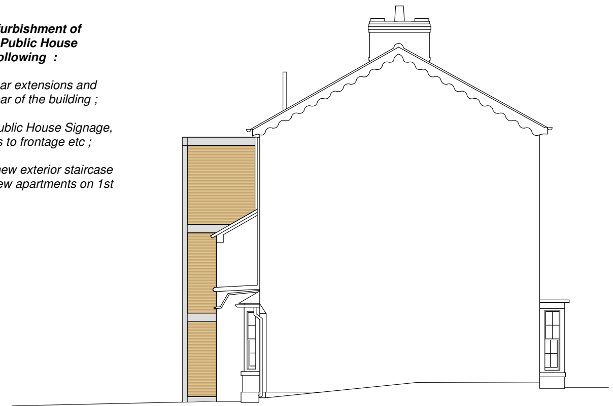
Proposed Side / North West Elevation