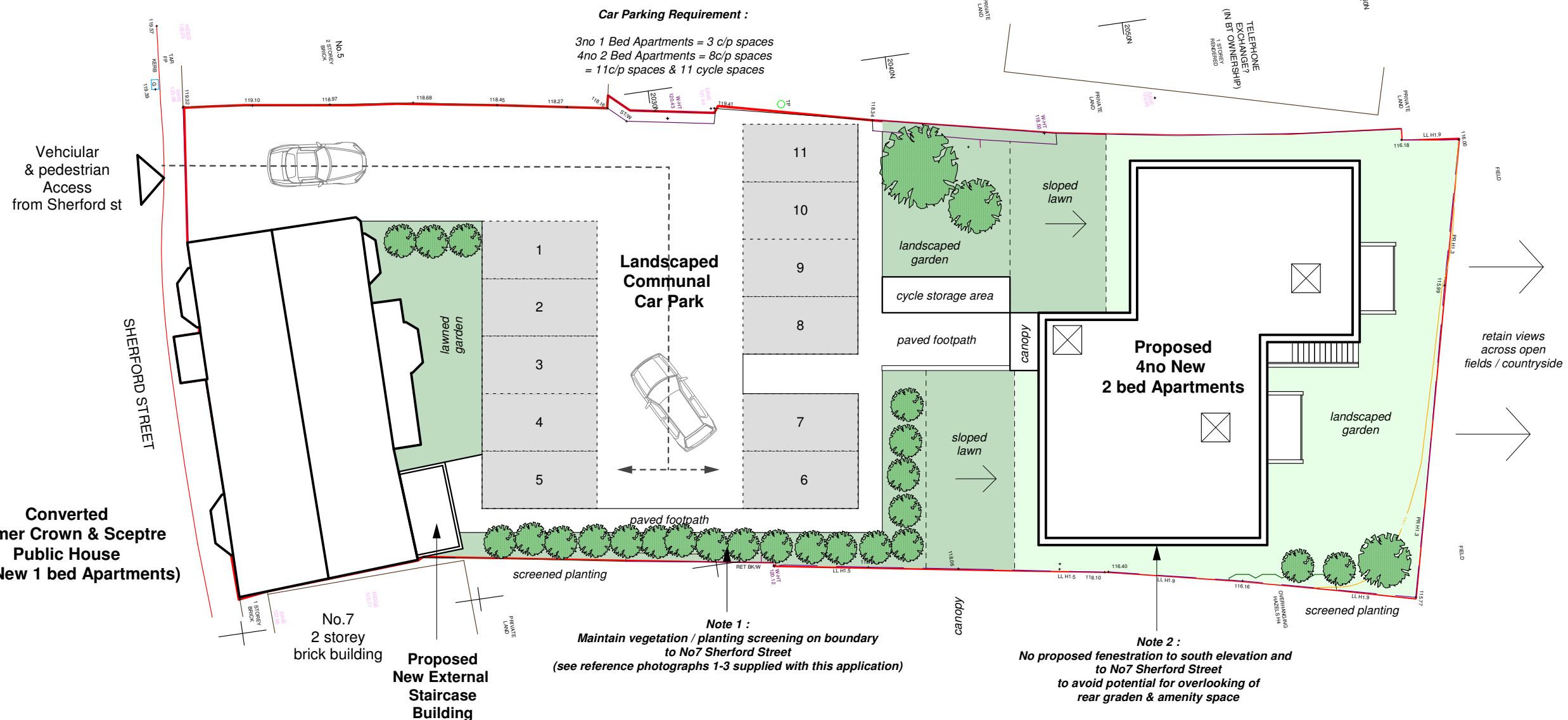
Proposed Site / Landscape Plan Scale 1:200