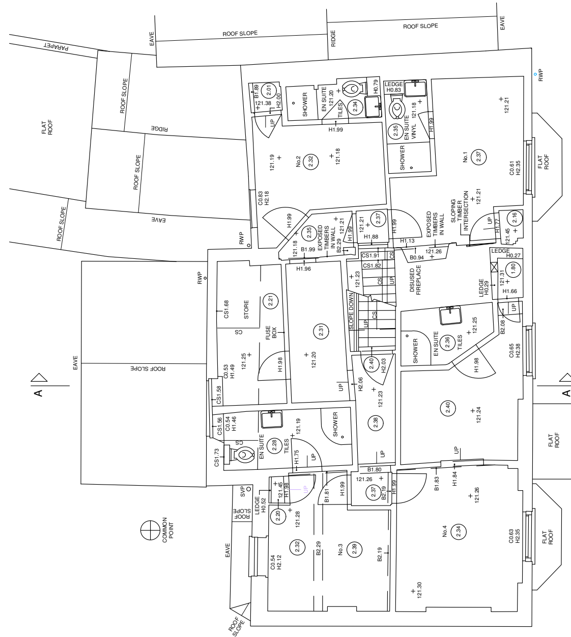
Existing First Floor Plan Scale 1:100