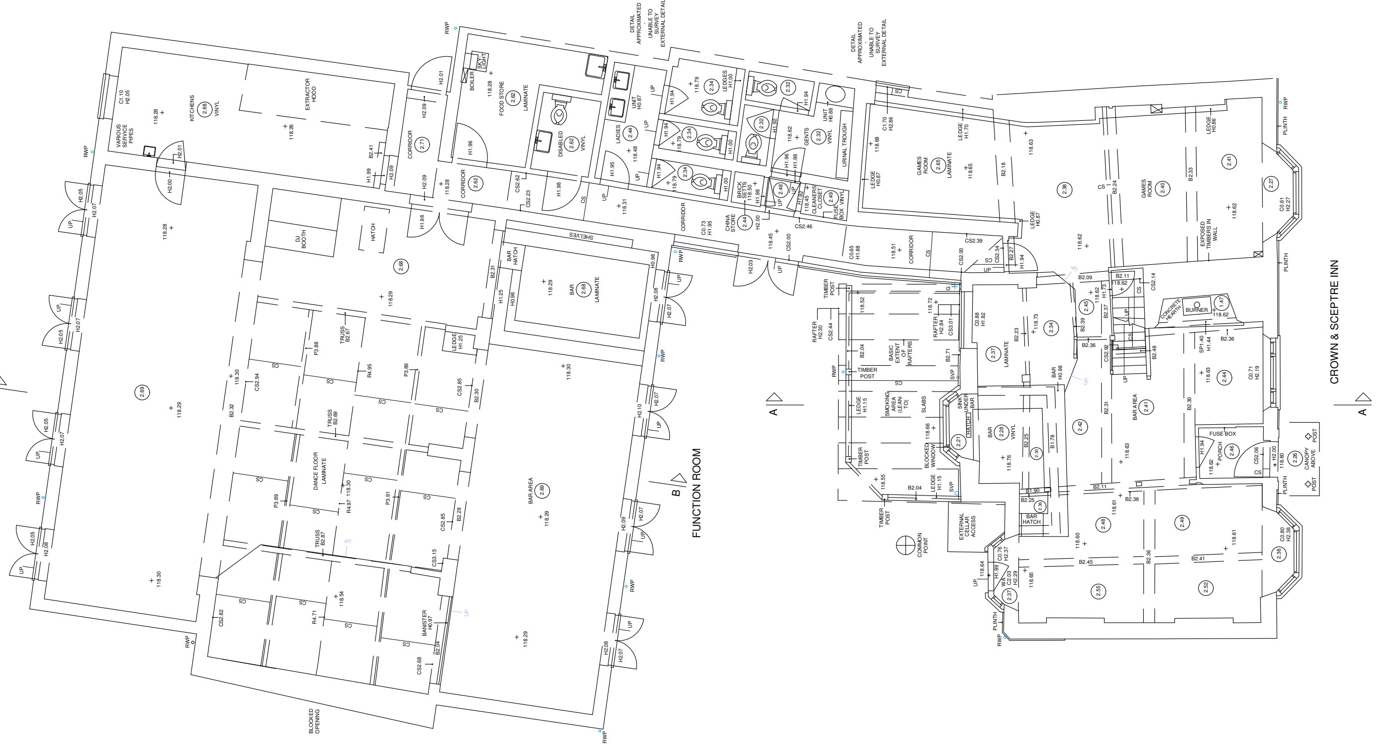
Existing Ground Floor Plan Scale 1:100