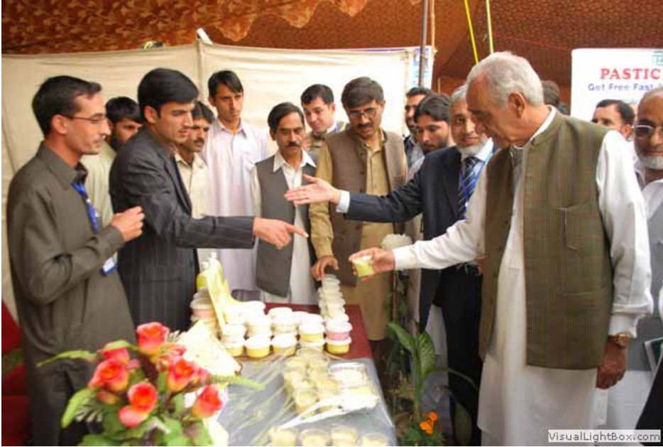
Dairy Tech Lab of AUP