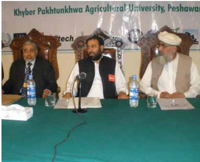
Minister chairing the concluding session