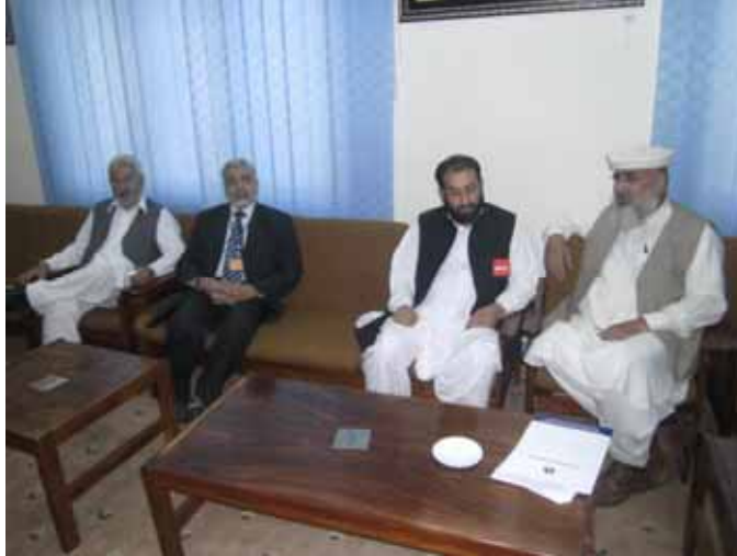
Minister with Vice Chancellor, Dean and DG Livestock