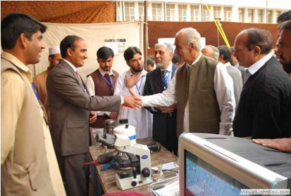
Semen Lab of AUP