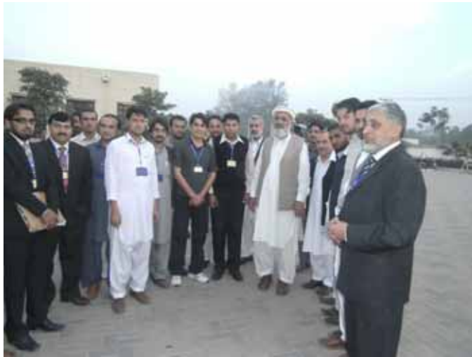
Vice Chancellor with staff and students