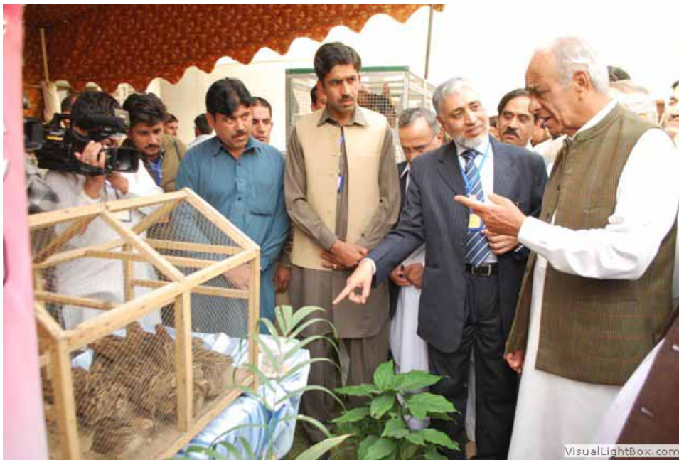
Quails flock of Poultry Science Department, AUP