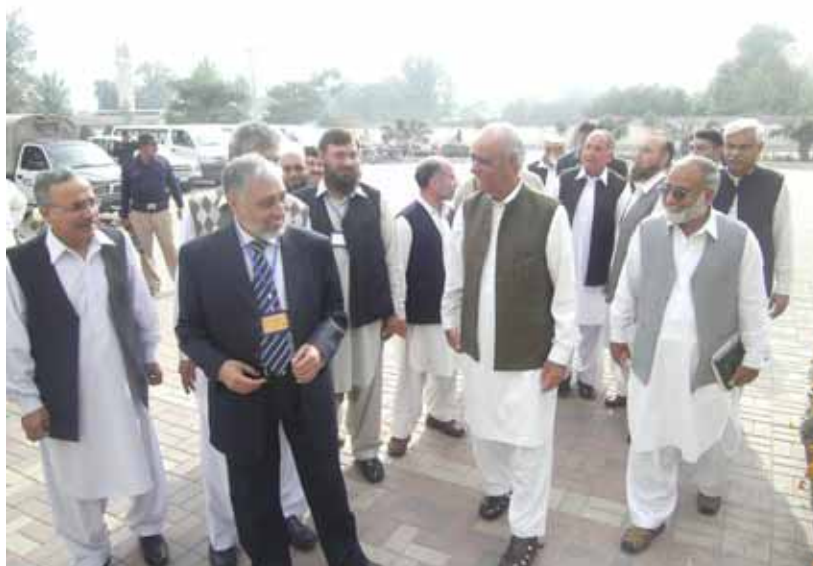
The Vice Chancellor and Dean welcome the Minister for Agriculture

The provincial livestock department has been helping the farming community through extension and research wings. The Directorate General of Livestock and Dairy Development (L&DD, Extension) has been engaged with various assigned tasks in discharge of its responsibility towards the development of livestock sector for the benefits of the public in general and the farming community in particular, in order to raise their income and living standard and protect them from the zoonotic diseases. The network of veterinary hospitals has been engaged in health coverage and extension. Breed improvement directorate and Animal Husbandry In-service Training Institute are working for their specialized mandates.