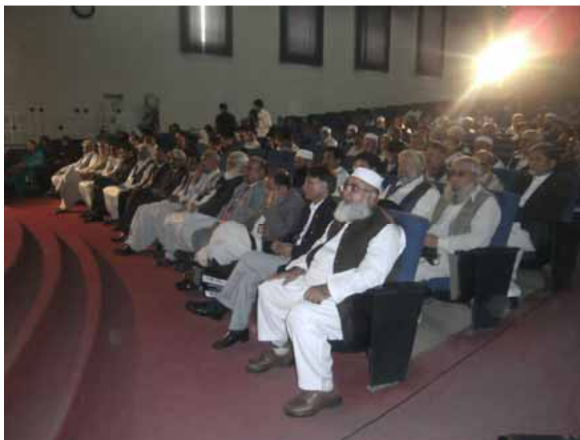
Delegates at the Inaugural Session