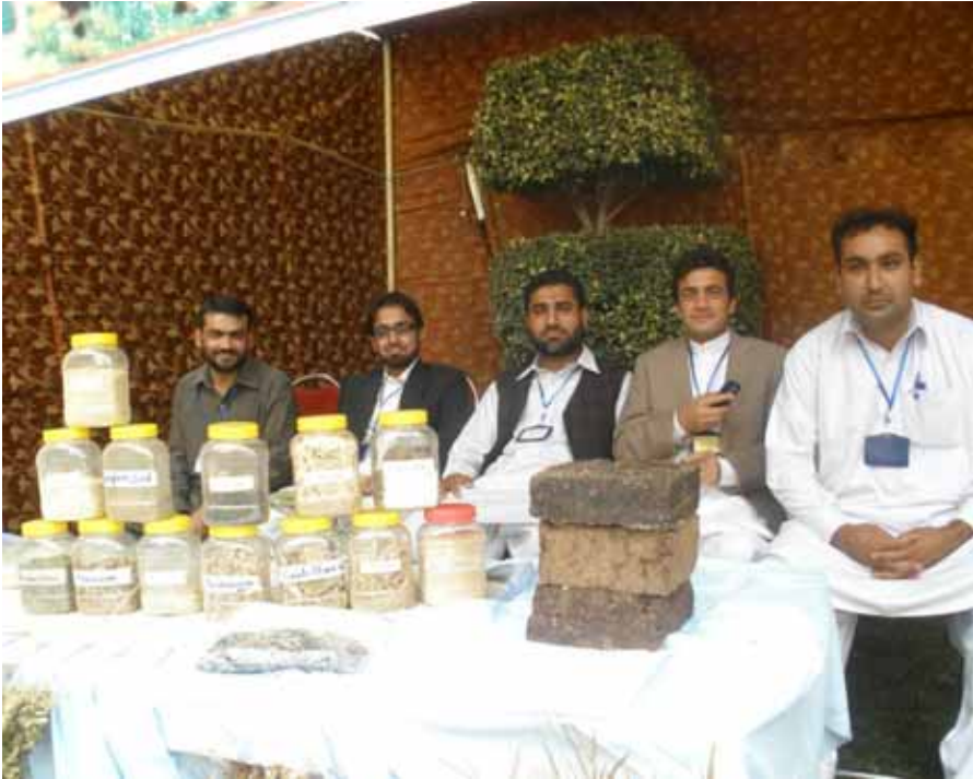
Feed Tech lab AU Peshawar