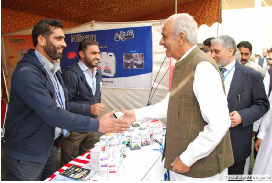
ICI Pakistan Ltd