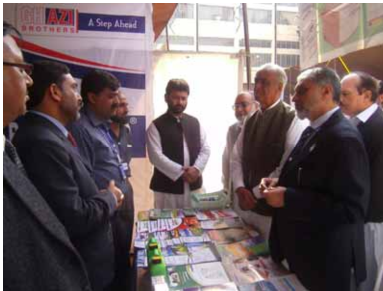
Minister visiting stall of Ghazi Brothers