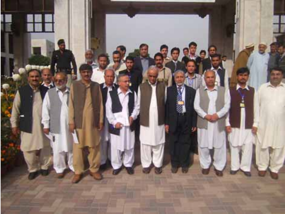
Minister for Agriculture with faculty members, students and delegates