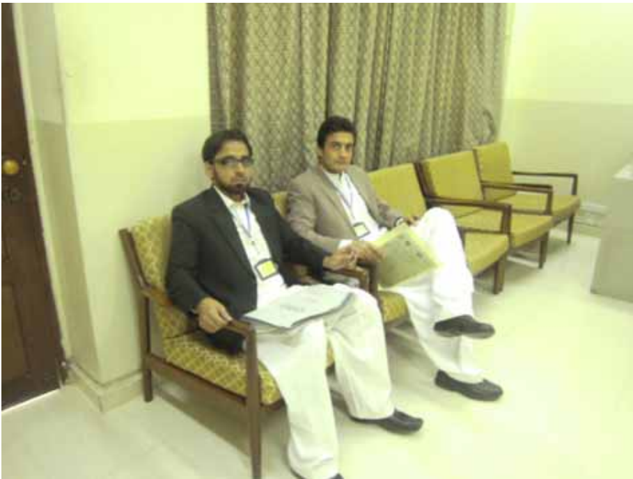
The student organizers