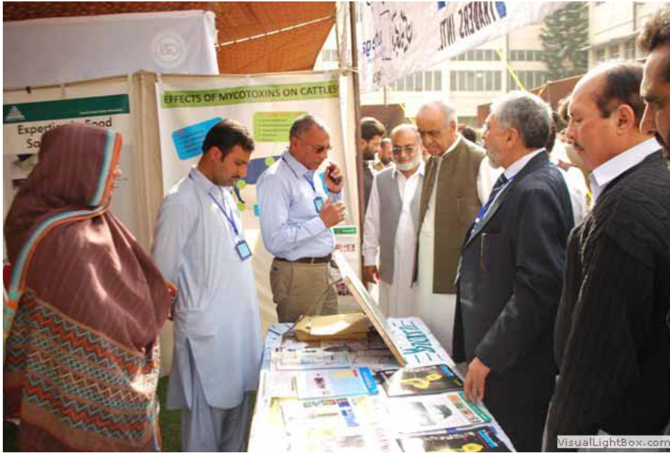
Romer Lab, Nasim Traders Rawalpindi