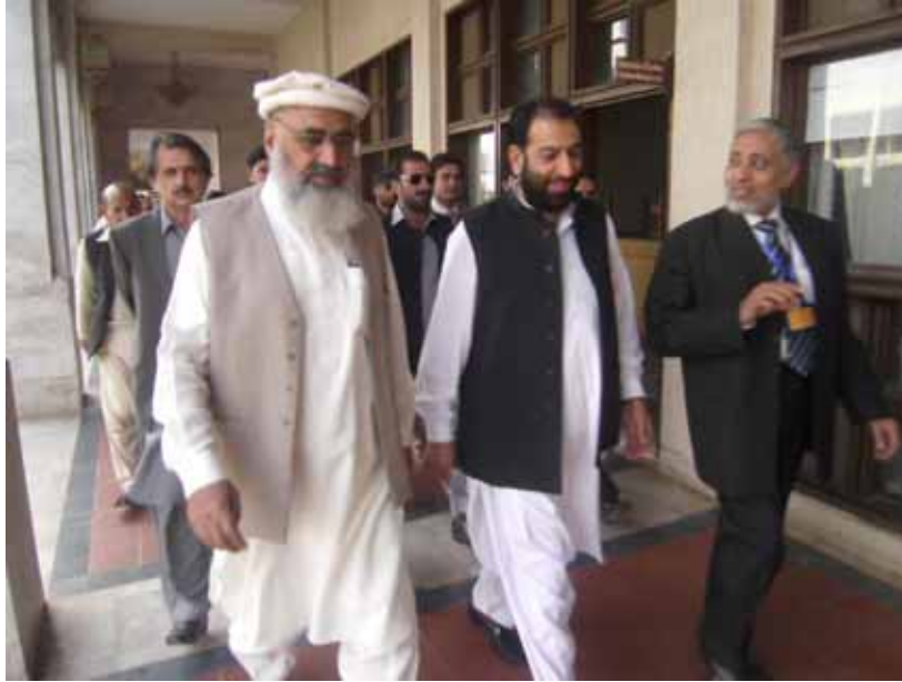
Minister reaching auditorium with Vice Chancellor and Dean

Quality Control Lab of the UVAS Lahore presented his work on locally developed vaccines which are more effective against foot and mouth disease and hemorrhagic septicemia diseases. He recommended work on research and local production of the vaccines.