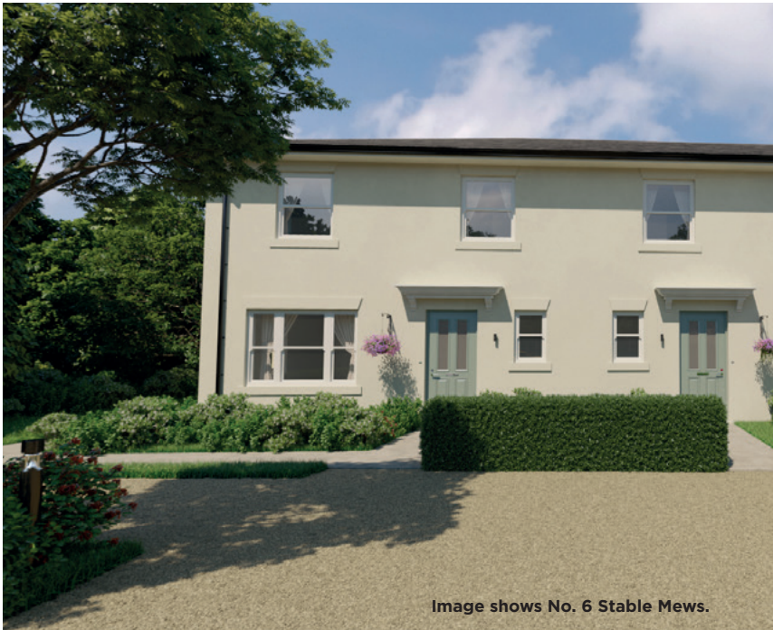
Image shows No. 6 Stable Mews.