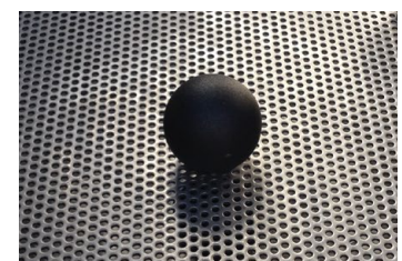
Unique weir filter system prevents support material blockages