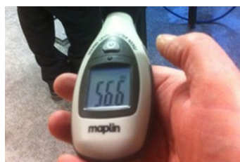
Acoustic foam sound proofing ensures the Quill Vogue Wash Station is as quiet as a normal conversation at only 60dB