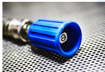
Wide angled fan jet for super-fast support material removal