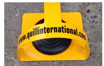
Easy to use foot operated controls