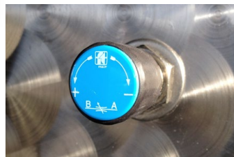
Range of water pressures (0-50bar/725psi) is available to operatives through the pressure control valve