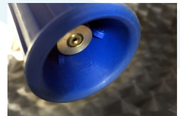
Powerful concentrated precision jet for complex geometries