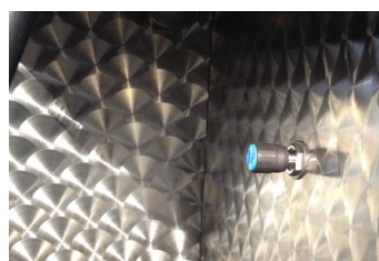
Circular polished stainless steel construction for system longevity