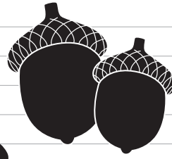
COMMON OAK QUERCUS ROBUR

Many different leaves can be found in local parks and streets.