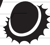
HORSE CHESTNUT AESCULUS HIPPOCASTANUM

COLLECT THE FRUIT OF THE HORSE CHESTNUT TREE IN LATE SUMMER AND PLAY CONKERS WITH YOUR FRIENDS. PUT THEM ON YOUR WINDOWSILL TO KEEP SPIDERS OUT. (IT REALLY WORKS!)