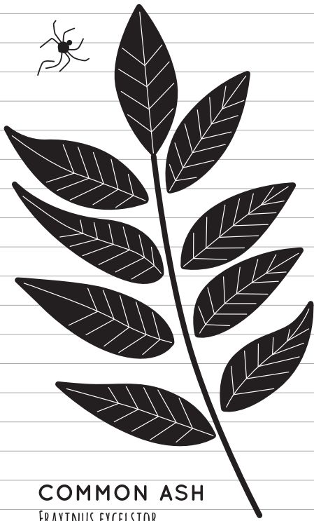
COMMON ASH FRAXINUS EXCELSIOR