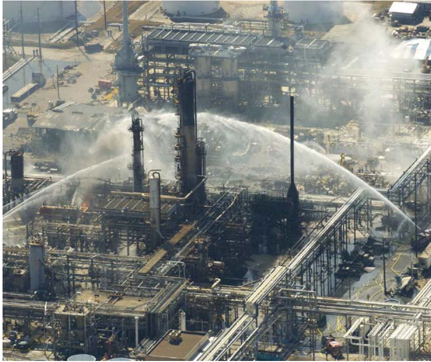
Below: The Texas City Refinery explosion occurred on March 23, 2005, when a hydrocarbon vapor cloud was ignited and violently exploded at the ISOM isomerization process unit at BP's refinery in Texas City, Texas, killing 15 workers, injuring more than 180 others and severely damaging the refinery.