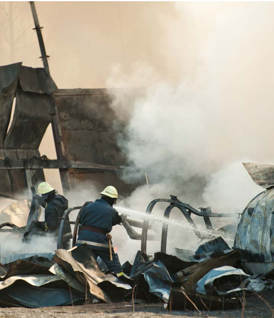
Left: Firemen attending the scene of a fatal airplane crash.