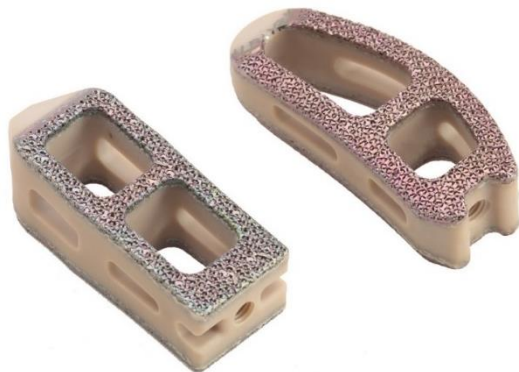
Caption: Surface Structure: Nanovis’ FortiCore TLIF interbody fusion devices.