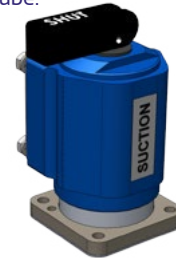
RIS-FLANGE2-SO-SUCTION-MK2-LT 2" shut-off suction module without suction tube.