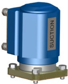
RIS-FLANGE2-SUCTION-MK2-LT 2" non shut-off suction module without suction tube.