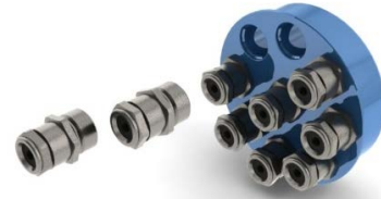
RIS-DONUT-9-20 shown above with optional cable glands

Body diameter 99mm 5 x M20 ports (without glands)