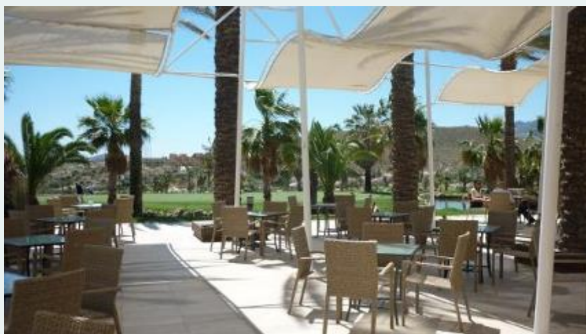
The Bar terrace with view to the 18 th Green,