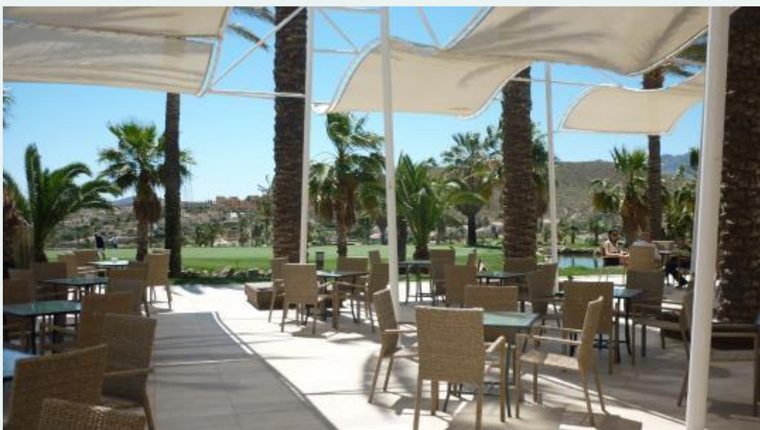
The Bar terrace with view to the 18 th Green, surrounded by water (the green, I mean)

To be able to charge the participants the same prices as this year, we need higher numbers. Generally, prices have gone up as golfers from Northern Europe seem to have discovered the weather-safe region in Southern Spain. We are trying to hold the price level at € 400 for players sharing, € 300 for non-players sharing and € 500 for players non-sharing a room.