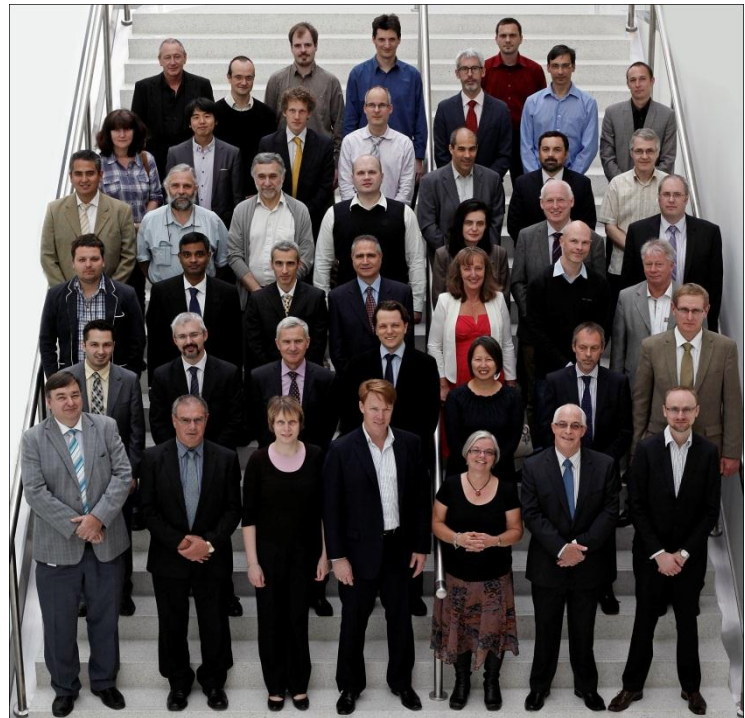
SIS-CC Workshop 2013 Participants. Please note: not all participants are shown.

All presentations from the workshop, which were made available right after, are still available on the workshop web site . In addition to the presentations you will find links to the Open Data API Initiative submissions as well as a selection of photographs taken during the afternoon of day 1 including the group photo as shown.