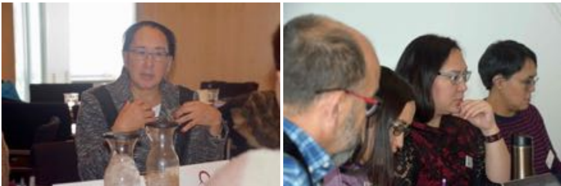
From the Breakout Groups, ICC Canada President, Nancy Karetak-Lindell.