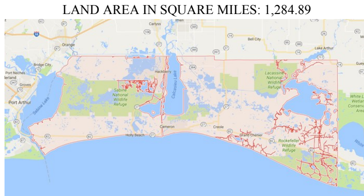
CAMERON PARISH MAP