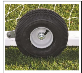
OPTIONAL WHEEL KIT