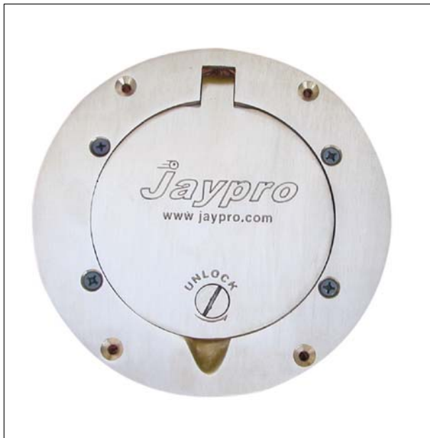
Top of cover

VOLLEYBALL GROUND SLEEVE FOR 3 1/2" O.D. UNITS