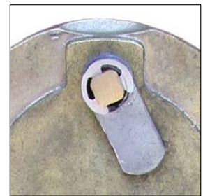
Underneath cover Locking Mechanism