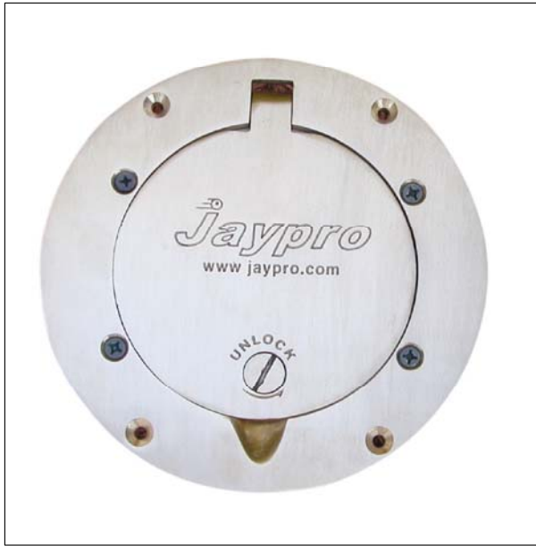
Top of cover

VOLLEYBALL GROUND SLEEVE FOR 3" O.D. UNITS