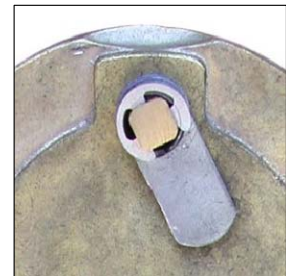
Underneath cover Locking Mechanism