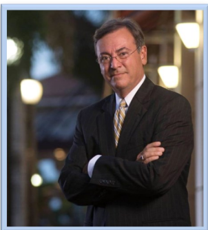
ALAN COHN U.S. Representative, Florida's 15th Congressional District