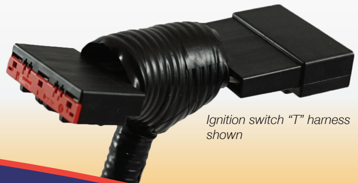
Ignition switch "T" harness shown

*Features may vary by make, model or year. See instructions for complete details. FCA vehicles may require an FCA remote start antenna.