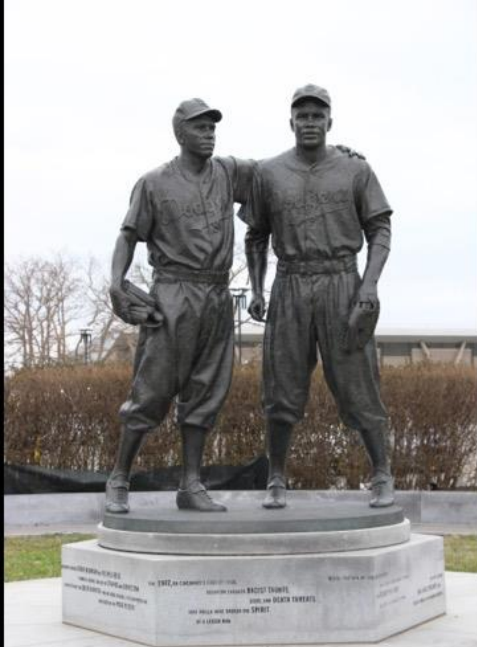
"Coney Island in Winter" by ShellyS is licensed under (CC BY-NC-SA 2.0)