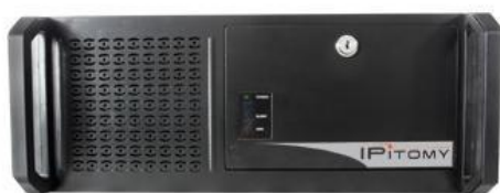
IP5000 - Pure IP PBX

Go to IPitomy.com for more details and a complete list of features.