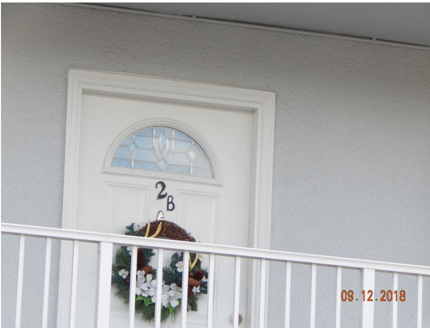
Unprotected Glazed Door