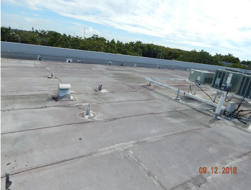
Built-Up/Rolled Asphalt Roof Covering