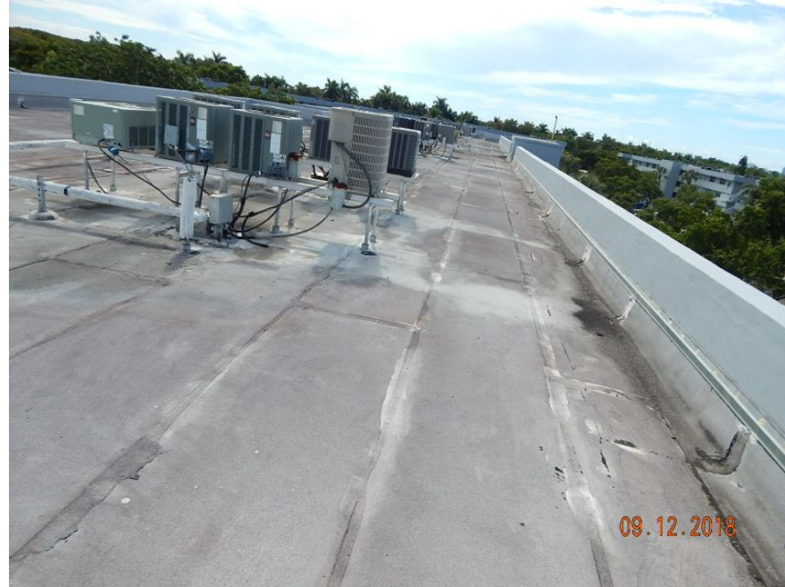
Built-Up/Rolled Asphalt Roof Covering