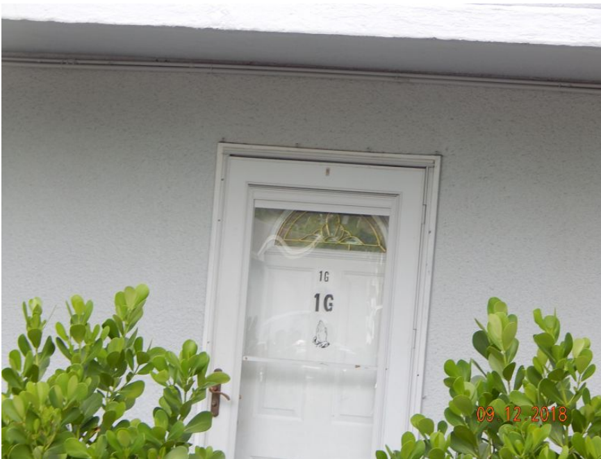
Unprotected Glazed Door