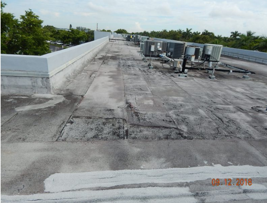
Built-Up/Rolled Asphalt Roof Covering