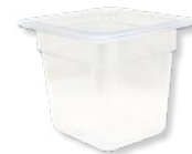
MEGA TOP | 24 X 1/6 PAN