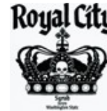
Charles Smith 2006 Royal City Syrah (Columbia Valley (WA))