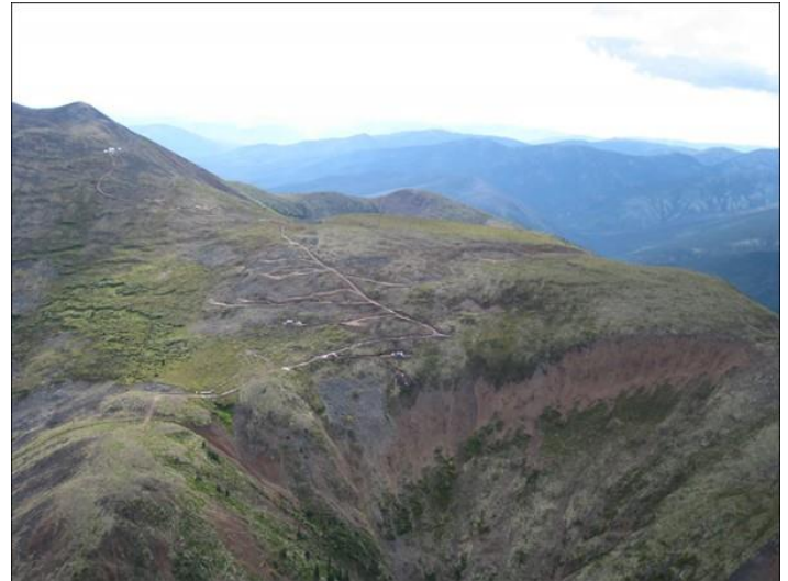
Resource Drilling Area