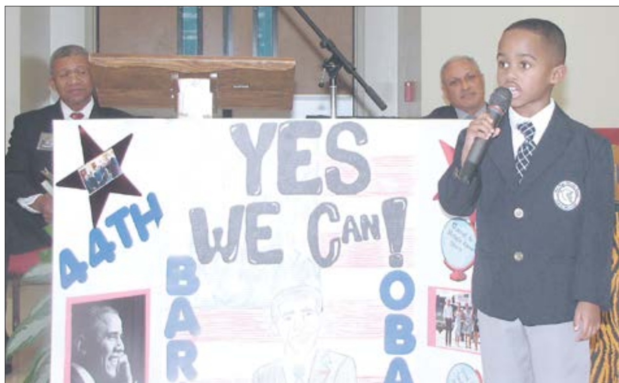
New Hope Christian School boy reminds audience of President Barack Obama's "Yes We Can" appeal for a better America.

During that particular phase, the children presented the subtheme titled I Won't Give Up; I Can't Give Up. Historical contributions of the following persons were recognized: prominent scientist and inventor, George Washington Carver; famous