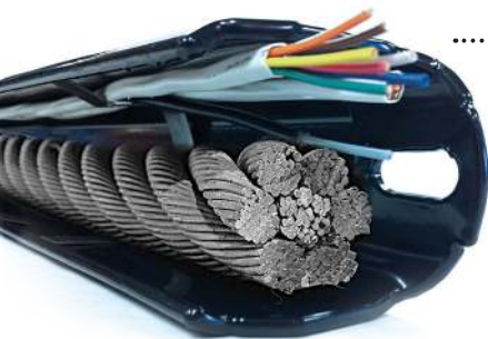
(inside of rail shown / view from protected side)

The Stalwart IS framework is a raceway for wiring, conduits, and/or security cabling required around the perimeter of a project. This integrated design eliminates the need for costly trenching and boring becoming a value added solution for perimeter security upgrades.