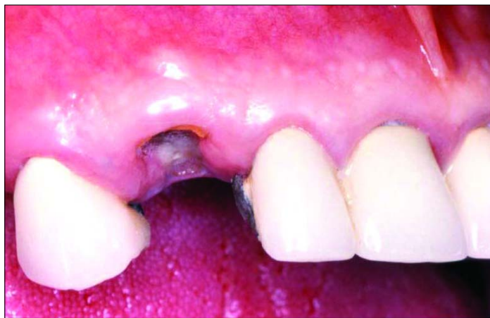
Figure 1. Initial presentation of tooth #6 below gingiva.

A 40-year-old woman presented to the dental clinic at New York Hospital Queens at the end of December 2003. There was very little remaining tooth structure on tooth #13 and a crown-lengthening