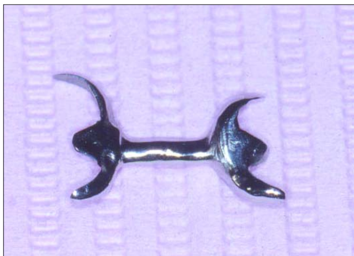
Figure 9. Evolution of Forced Erupter, which is now fabricated to allow easy bonding to adjacent teeth.