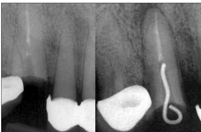
Figure 6. Radiographs depicting before and after. Note 4 mm of apical radiolucency immediately after eruption.

procedure was recommended (Figure 8). However, after careful review, it was decided that too much bone would have to be compromised from the adjacent teeth for crown lengthening to be advantageous. So, forced eruption with the Forced Erupter was suggested.