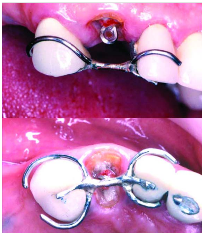
Figure 3. Appliance placed 4 mm below post hook and then centered with occlusal adjustment.