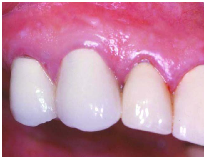
Figure 7. Tooth #6 two and one-half years post-eruption.

Durham et al. 10 use an anchorage device to stabilize the tooth after forced eruption that incorporates a temporary restoration. It is interesting to note that their stabilizing device is very similar to our appliance for forced eruption.