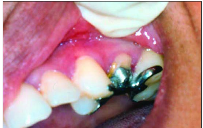
Figure 11. Tooth #13 fully erupted and flush with Forced Erupter's bar.