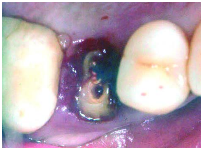
Figure 8. Tooth #13 after caries removal.