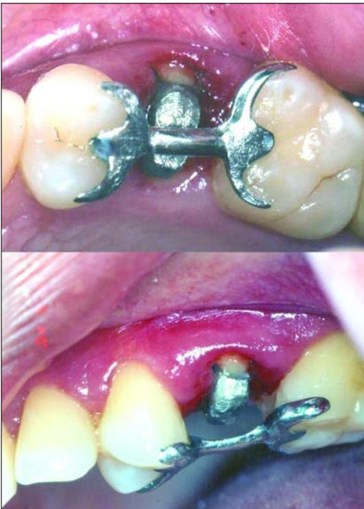
Figure 10. Forced Erupter placed 3 mm below post and then centered with occlusal adjustment.

Here we are presenting an appliance that rests on the adjacent restorations and does not alter them in any way. This Forced Erupter was thought out specifically for these situations and like many new ideas, has gone through changes and experimentation until perfected.