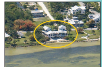
CHARLOTTE HARBOR BEACH FRONT

2 bed/2bath, dock with davits, new a/c unit in 2016, carport, inside laundry. Master opens to deck at rear of unit. $165,900