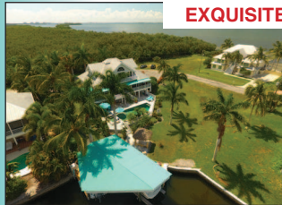
EXQUISITE 3/3 HOME!