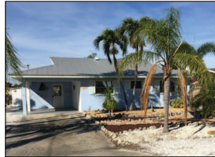
CUTE, CUTE GEM!

So many new upgrades, 3 new a/c units, 3 new water heaters, new huge pool with water sheers and hot tub, 2 covered boat lifts, large outdoor entertainment area with state of the art kitchen and bar, seating for 10+. If you are looking for a one of a kind bay view home you must view this home. $1,150,000