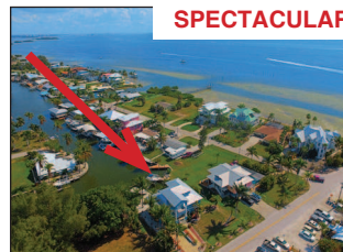
SPECTACULAR HOME & ACCESS

MARINE CONTRACTING & DOCK BUILDING BUSINESS Sale includes ALL equipment, barge, truck, trailers. 13,000 sq. ft. income-producing lot, 4 rented boat lifts, 1 wet slip. $649,900 or option to purchase business only for $300,000