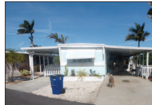
WATERFRONT MANUFACTURED HOME

Gulf access, 2/2, stilted home. Great get away vacation home or good numbers from our rental program. $342,000