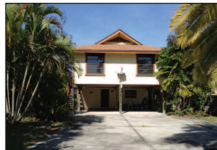
ST. JAMES CITY

Sweet 3 bed 2 1/2 bath, elevated, custom home built in 1990. Seawall, no bridges $389,000