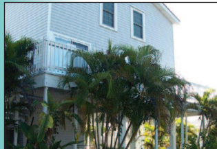
ST. JAMES CITY - QUICK ACCESS!

WHAT A VIEW! St. James City on open water. WENT PENDING IN OFFICE IN 10 DAYS! Virtual tour www.swfl360.com/nf2150 $997,000