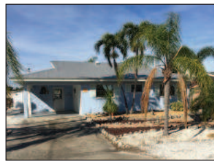
CUTE, CUTE GEM!

So many new upgrades, 3 new a/c units, 3 new water heaters, new huge pool with water sheers and hot tub, 2 covered boat lifts, large outdoor entertainment area with state of the art kitchen and bar, seating for 10+. If you are looking for a one of a kind bay view home you must view this home. $1,150,000