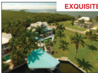
EXQUISITE 3/3 HOME!