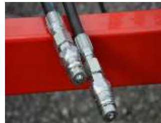
7-pin connector & hydraulic hoses