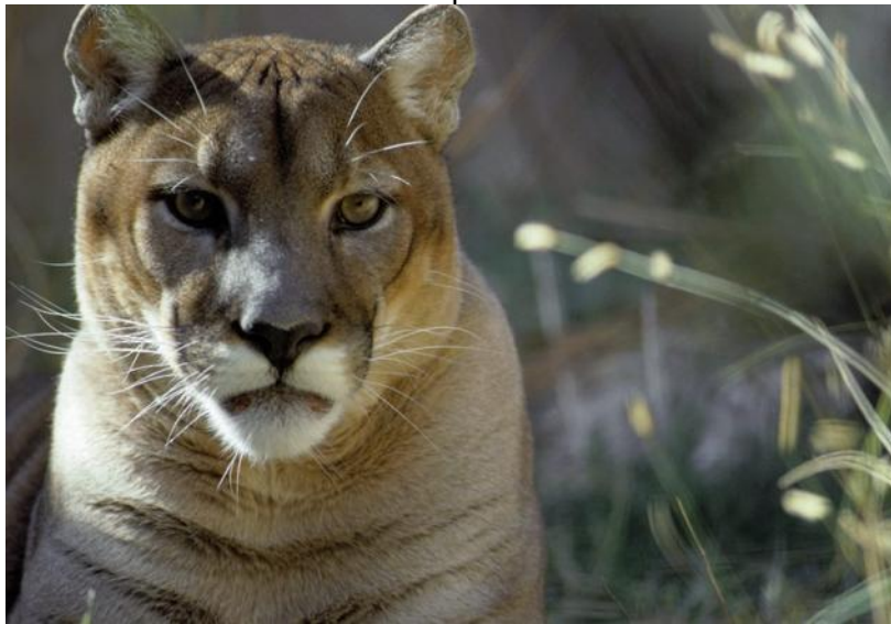
Mountain Lion ( Puma concolor )

Ecosystem recovery in Yellowstone began when wolves were reintroduced 70 years later. Elk numbers dropped somewhat, but more importantly, the elk changed their behavior and use of space to avoid what were now high-risk riparian areas. They spent more time on hillsides and deeper in the forest—places where they could more easily see and flee wolves—and as a result aspens returned to places where they hadn't grown in decades. (Indeed, a separate study of wolf-elk kill sites suggests that landscape features often tip the balance in predator-prey outcomes.) Subsequent research elsewhere in the Rockies supported these findings.