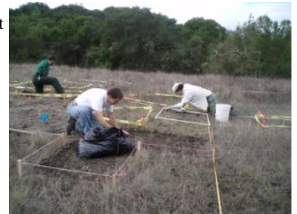
Thormmint site preparation

Plants were grown at the UC Botanical Garden at Berkeley, using seed collected years ago from Edgewood. Although still small, nursery-grown plants grow larger and produce more seeds than their wild counterparts, especially in dry years. In early November, 12,500 thormmint seeds from those propagated plants were planted near existing thormmint in Edgewood. Planted areas were treated with scraping or hand weeding, and a biologist and volunteers have been diligently hand watering the seeds. By late November, tiny seedlings had begun emerging.