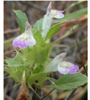
Thormmint

Did you know there's a plant found ONLY at Edgewood? In fact, when some people were planning to turn Edgewood into a golf course, the discovery of the San Mateo thormmint ( Acanthomintha duttonii ) was important proof that Edgewood contained rare species and was worth saving. Historical populations are known from the San Francisco Water District property and Emerald Hills, but these colonies have long since faded away. And sadly the last remaining population at Edgewood has been in decline for years. In 1998, 53,000 individuals were estimated; in 2008, a careful census yielded only 249. This diminutive annual mint is being overrun by invasive annual rye grass, and may be suffering from altered water flows uphill.