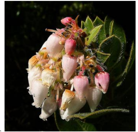
Kings Mountain Manzanita ( Arctostaphylos regismontana ).

one-third of the manzanita species have a burl at the base of their main stem—a swollen woody mass that contains dormant buds from which plants can sprout. Most manzanita species have a symbiotic relationship with mycorrhizal fungi, as manzanita habitats generally have nutrient-poor, acidic soils, and the mycorrhizal fungi provide nutrients for the soil.