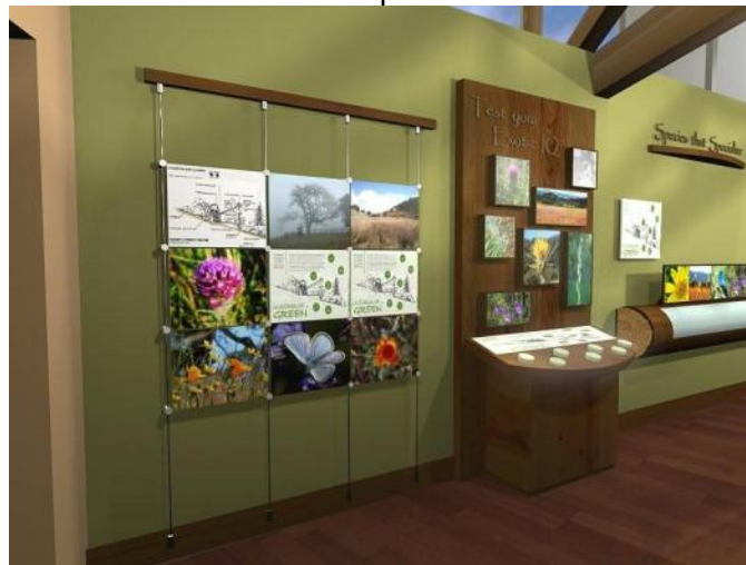
Rendering of the proposed Education Center

Most of you reading this have contributed toward the funding of the Education Center, and once again, I wish to thank you for your generous support. I hope to see you at the groundbreaking ceremony, and look forward with great anticipation to the grand opening in 2010. 📷