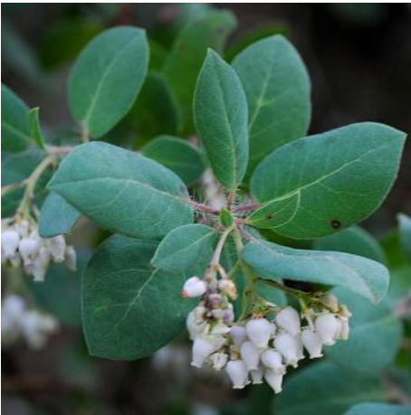
Hairy Manzanita ( Arctostaphylos tomentosa )

We will be speaking in a generic sense about the healing qualities of the manzanita species.