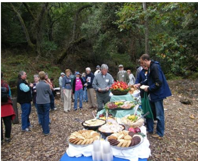
Folks & Food at the Annual Meeting.