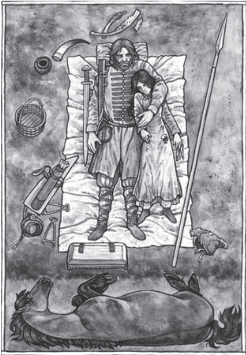
Figure 10. Chamber grave 36 from the Shestovytsya cemetery near Chernihov, Ukraine, dating to the tenth century CE. The double burial of a man and a woman contains numerous artefacts of Scandinavian origin, typical of the Rūs hybrid culture. Reconstruction by Vera Olsson, following the original excavation plan (Blifeld 1977) and in consultation with Fedir Androshchuk. This image is reproduced in colour on p. 120.