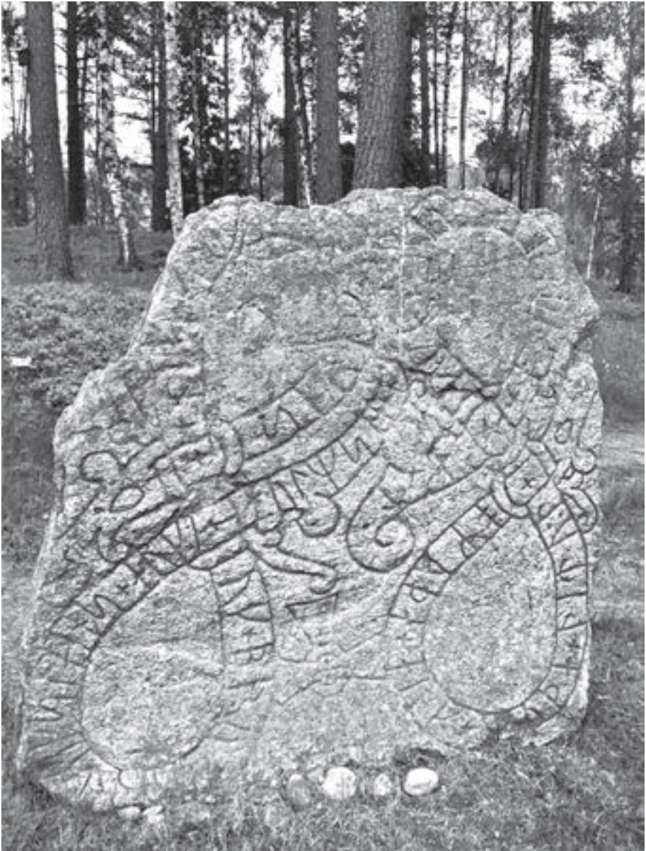
Figure 13. Runestone Sö 297 from Uppinge in Södermanland, Sweden. The inscription reads, ‘ Amoða ok Moða letu leggja stein þenna at Sigræif, bonda sinn, ok broður Sigstæins ok Holmstæins ’ (Amoða and Moða had this stone laid to Sigræif, their husband, and Sigstæin’s and Holmstæin’s brother). The similarity in the women’s names perhaps implies that they were related. This image is reproduced in colour on p. 122.